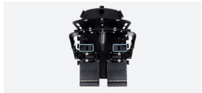
Depth position of the seat plates