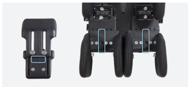
Position of the wedge and mounting kit for wedges.