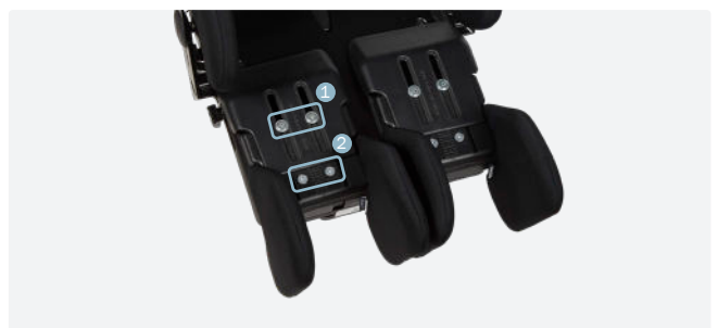
Loosen (1) or demount (2) the wedge.