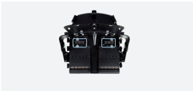
Angle and width position of the seat plates

The seat plates and other parts of seat can also be disinfected with a 70% disinfectant IPA solution. It is recommended to clean with warm water and soap and let it dry before disinfection.