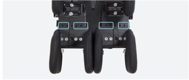
Position of the inner and outer knee supports.