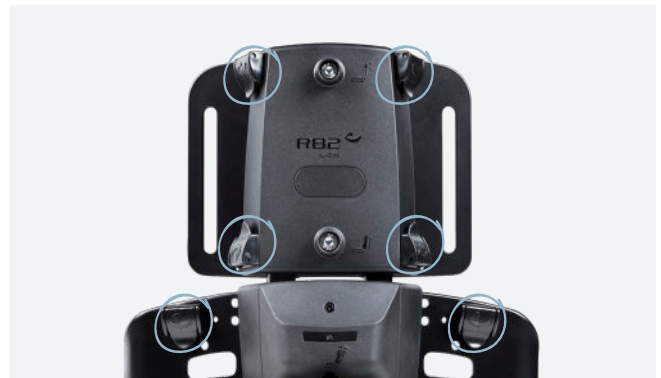
Fix locks at the lower back and upper back for mounting of vest.