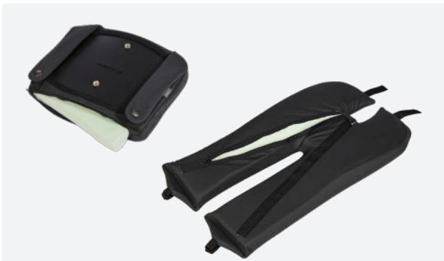
Cover and foam for upper back cushion and seat cushion.

When cleaning underneath the seat cushion it can be necessary to loosen or remove some of the accessories. Not all seats will have the same accessories and there can be parts that can be skipped. It is not recommended to wash the foam part.