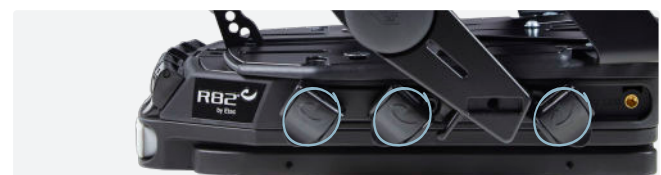
Fix locks at the seat base for mounting of belt.