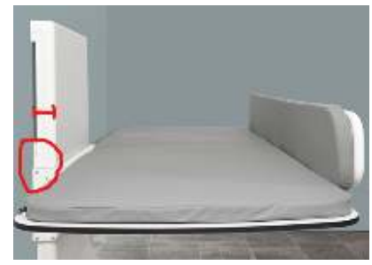
New hinge mechanism