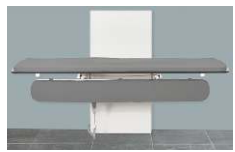
Ropox Vario Changing Bed