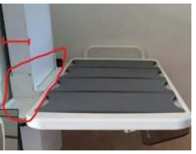
Old hinge mechanism