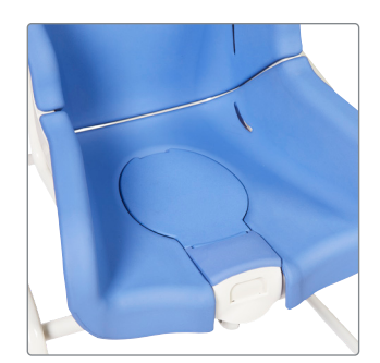
Seat infill, blue 8707x-61