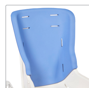
PU inlay, blue, for back