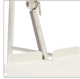
Rod for foot support 8702x