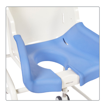
PU inlay, blue, for seat