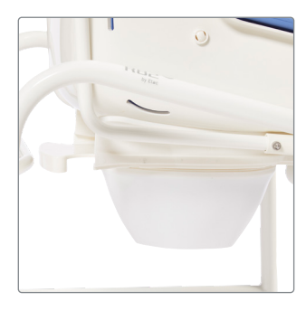
Potty ring 87080x