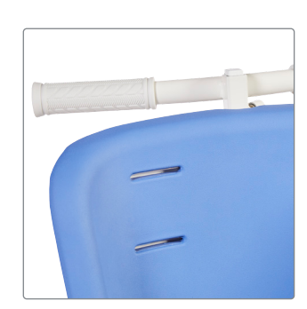
Push handle one size - 880110