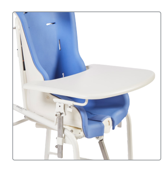
Tray, ABS 870xx