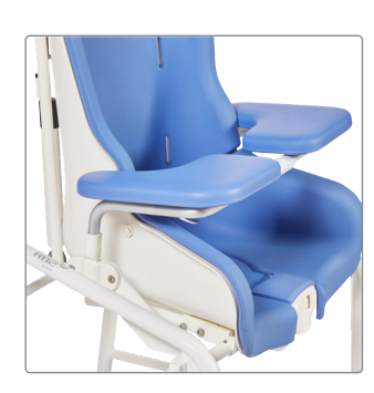
Swing-away armrest / tray 87013x-61