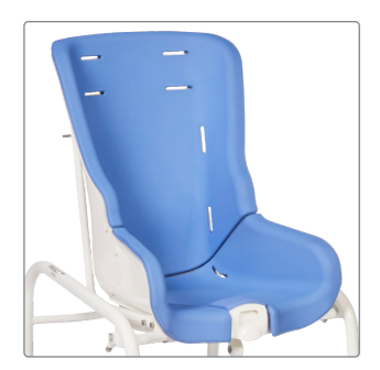
PU inlay, blue, complete 8706x-61