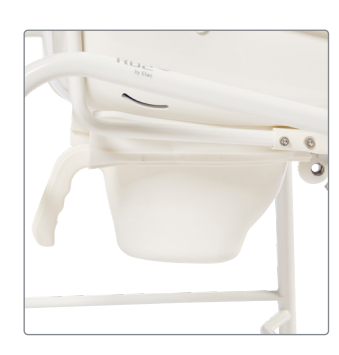
Commode pan 87080x